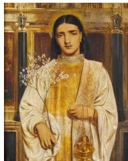
Image: Simeon Solomon, A Saint of the Eastern Church (formerly called A Greek Acolyte), 1867 - 1868.

Discover an online series of talks inspired by the exhibition Scented Visions: Smell in Art 1850-1915 . Leading scholars will guide us through the invisible world of fragrance in art, and how scent was imagined, symbolised, and spiritually charged in Victorian and early 20th-century painting. From the olfactory imagination to sacred incense and symbolic flowers, these talks reveal how smell shaped meaning and emotion in some of the period's most evocative artworks. All talks are online and can be booked individually or as a series. Recordings will also be made available.