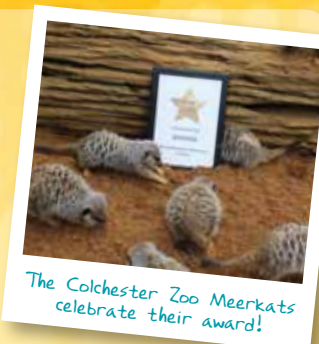
The Colchester Zoo Meerkats celebrate their award!

WINNER: COLCHESTER ZOO RUNNER UP: BARLEYLANDS, BILLERICAY