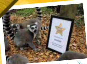
The lemurs at Colchester Zoo with their award

Primary Times STAR AWARD 2018 AS CHOSEN BY READERS